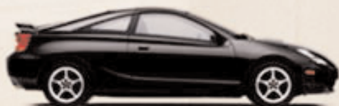
Black with Black (GT-S) or Black/Silver (GT) Interior