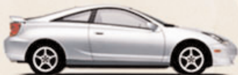
Liquid Silver Metallic with Black (GT-S) or Black/Silver (GT) Interior