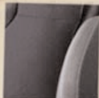
GT fabric in Black/Blue, Black/Red and Black/Silver (shown)