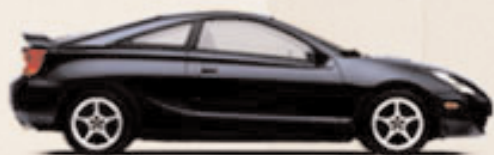
Carbon Black with Black (GT-S) or Black/Blue (GT) Interior