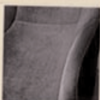
GT-S fabric in Black