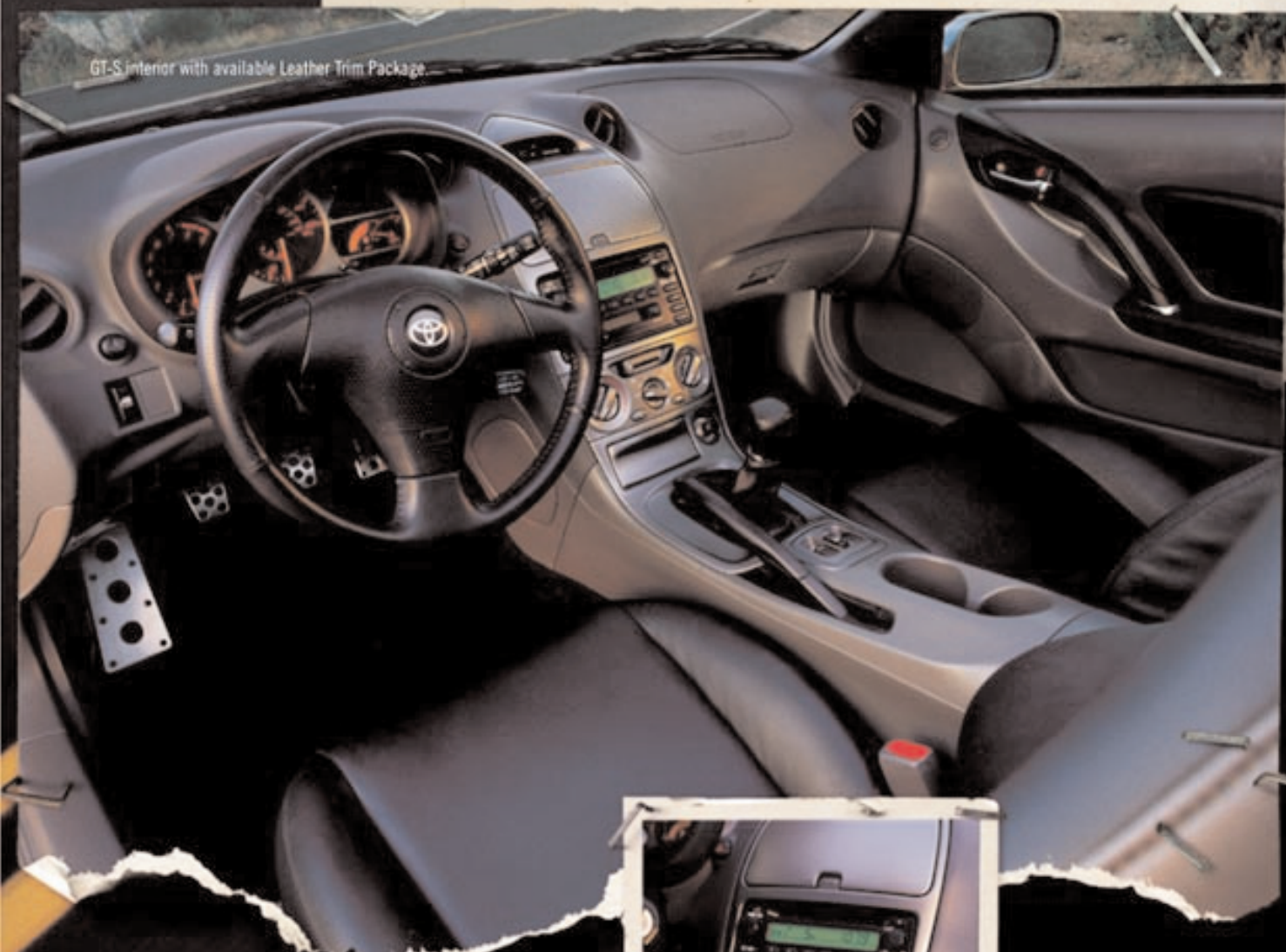
GT-S interior with available Leather Trim Package