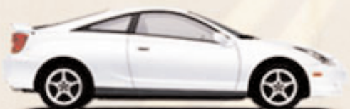
Super White with Black (GT-S) or Black/Silver (GT) Interior