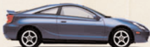
Spectra Blue Metallic with Black (GT-S) or Black/Blue (GT) Interior