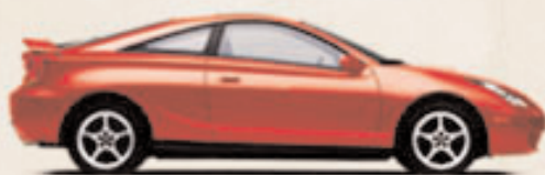
Absolutely Red with Black (GT-S) or Black/Red (GT) Interior